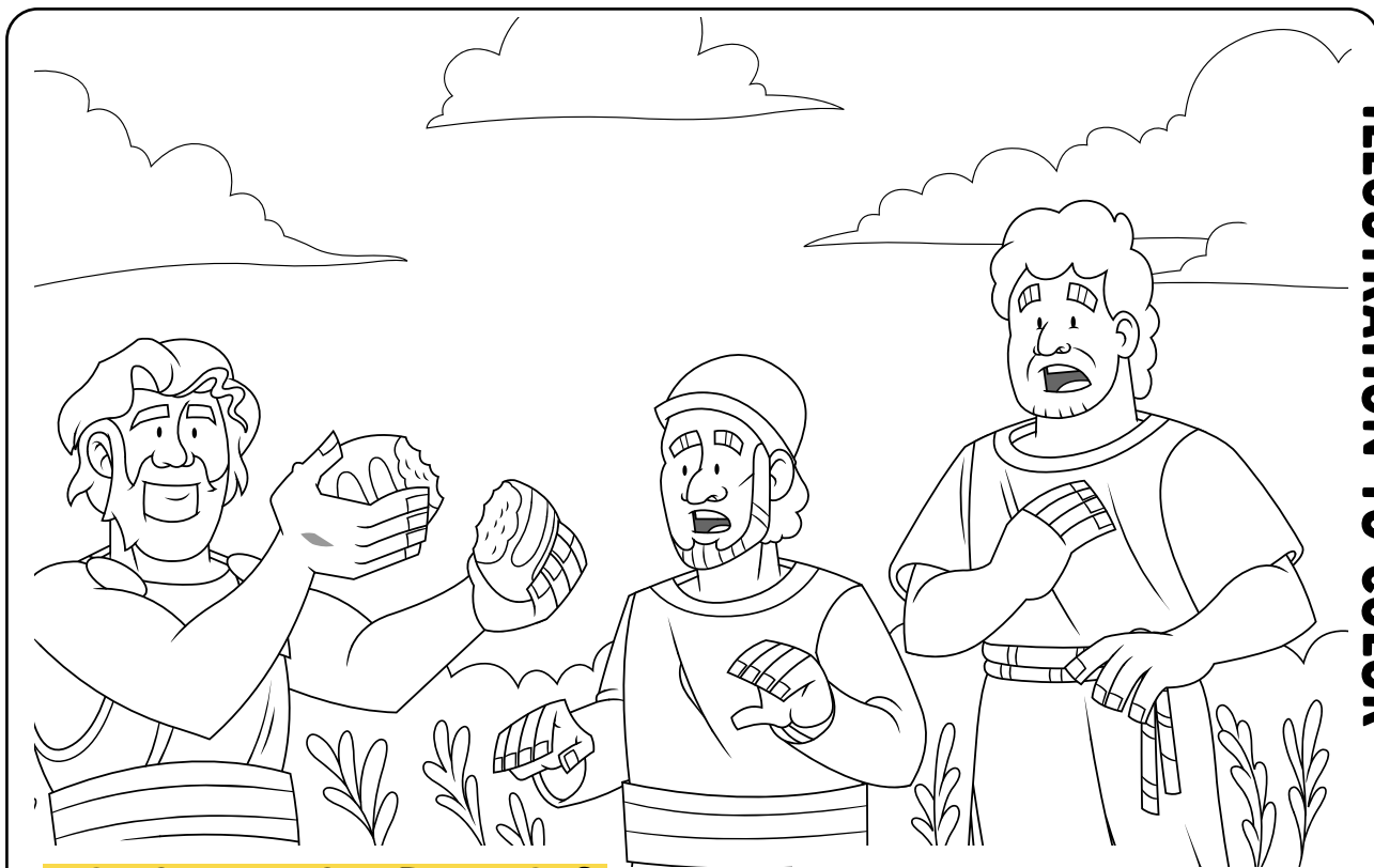
ILLUSTRATION TO COLOR